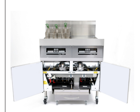
FPH265G Shown with optional computers, filtration and casters

*Matching cabinet required for optional filtration.